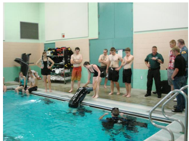
Class in water rescue during the 2012 camp.

Bunk space is limited! We can take 26 students for 2013, so apply as early as possible. If you get turned down this year because of lack of space, and will be a senior next year, you will have priority for next year.