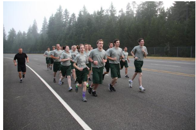
A morning run on the drive course at the 2012 camp.

Eric Rasmussen (sorry – no photo) also from the Class of 2007, graduated from the 100 th WSP Academy in December 2012. He is also now one of the new WSP Troopers on our roads.